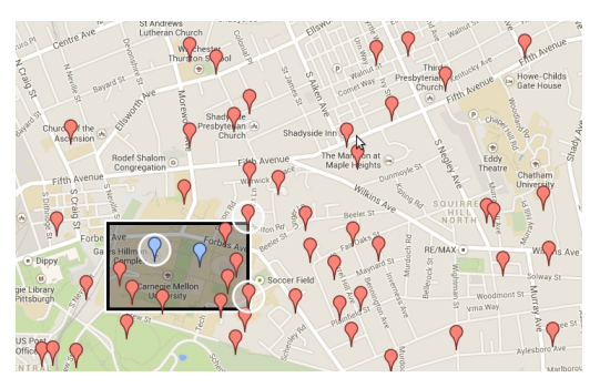
Figure 4: Synthetic and Real Glass Users

User preferences about receiving queries may vary considerably, depending on the individual, time, location, query topic, and reward offered. For example, a user might not want to receive any query at specific locations such as home or library, or anywhere after 9pm. QuiltView provides for flexible expression of such user preferences using a JSON specification. A user can specify a maximum number of queries that she/he is willing to receive for a given time (e.g., 5 queries per day). To meet this preference, the system keeps track of the query sent time and responded time for each user. When a new query is posed, QuiltView first identifies relevant Glass clients based on their locations and the geographic scope of the query. Then, it factors in their preferences to obtain a smaller set of eligible users. From this subset of eligible users, QuiltView randomly chooses the desired number of users and delivers the query to them.