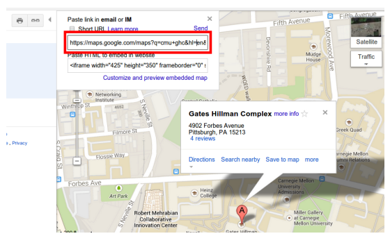
(a) Location URL from Google Maps